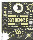
The Science Book

Science gets big, weird, and wonderful. Flip through ideas, experiments, and discoveries that connect everyday curiosity to how the universe works.